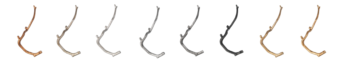
Copper Silver (FP) Silver/White Lead (CH) Palladium Black (PR) Gold/White Gold (FO) (CO) Patina (PL) Patina (FO/PB)