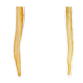
Bright Honey Gold (06) (04) METAL FINISHES