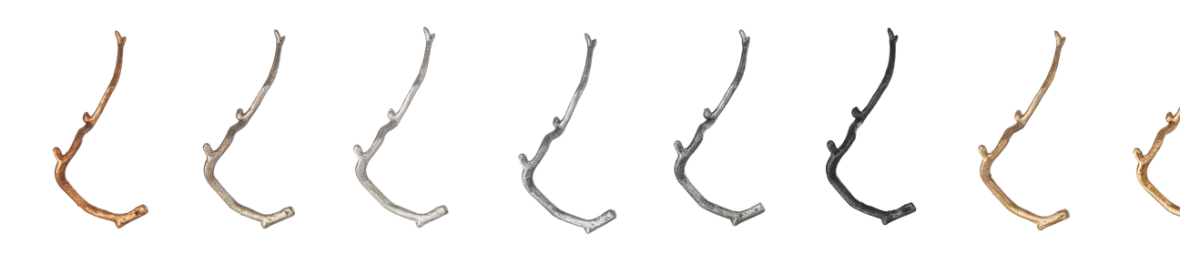
Copper Silver (FP) Silver/White Lead (CH) Palladium Black (PR) Gold/White Gold (FO) (CO) Patina (PL) Patina (FO/PB)