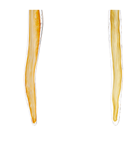
Bright Honey Gold (06) (04) METAL FINISHES