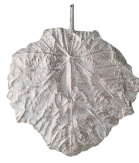
Silver/White Patina (FP/PB)