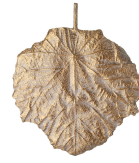
Gold/White Patina (FO/PB)