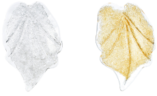
Clear (10) Bright Gold (06)