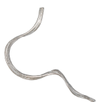
Silver/White Patina (FP/PB)