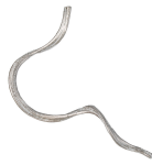
Silver/White Patina (FP/PB)