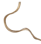
Gold/White Patina (FO/PB)