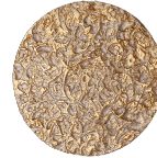
Gold/White Patina (FO/PB)