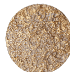
Gold/White Patina (FO/PB)