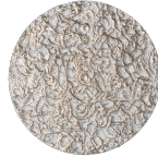
Silver/White Patina (FP/PB)