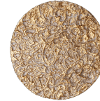
Gold/White Patina (FO/PB)