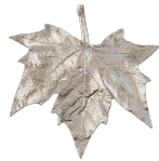
Silver/White Patina (FP/PB)