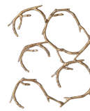
Gold/White Patina (FO/PB)