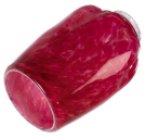
Ruby and Opal (R50)