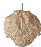
Gold/White Patina (FO/PB)