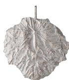
Silver/White Patina (FP/PB)