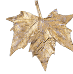
Gold/White Patina (FO/PB)