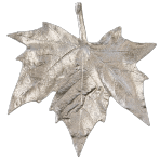
Silver/White Patina (FP/PB)