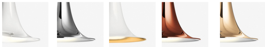
BC/BC White/White CR/BC Chrome/White BC/OR White/Gold BR/BC Bronze/White RO/BC Pink Gold/White

EELc (Energy Efficiency Label compatibility): A, A+, A++