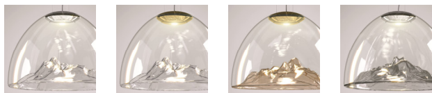
CS / CR Crystal / chrome CS / OR Crystal / gold AM / OR Amber / gold GR / CR Grey / chrome

EELc (Energy Efficiency Label compatibility) contain built in LED lamps that cannot be changed: A, A+, A++