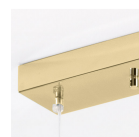
OR Gold leaf finish

EELc (Energy Efficiency Label compatibility) contain built in LED lamps that cannot be changed: A, A+, A++