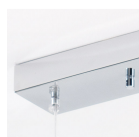
CR Chrome finish