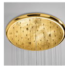
OR Gold leaf