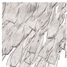
CS "Rigadin" crystal