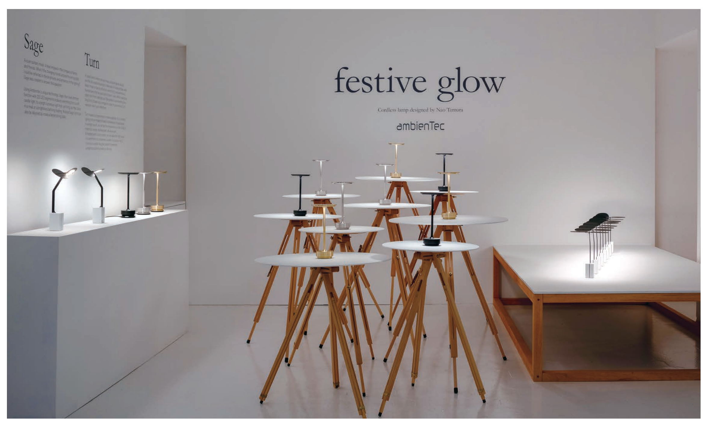
Spazio Rossana Orlandi, Milan April / 2019