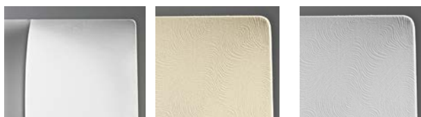
BC White FA Ivory pattern FB White pattern

EELc (Energy Efficiency Label compatibility): E, D, C, B, A, A+, A++