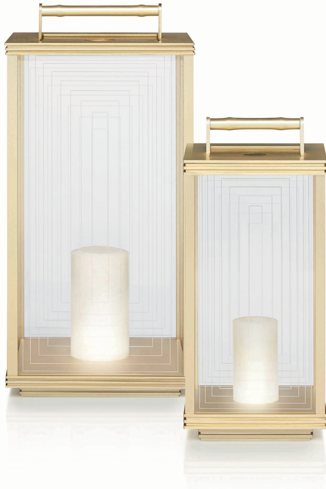
PICNIC Table Lamp