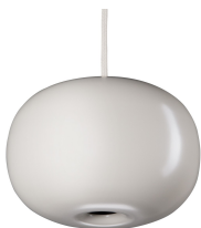
WARM GRAY RAL7032, METAL

Pebble enables light to work in different ways, depending on the choice of material. Its shape encapsulates the light, which is distributed differently depending on whether the lamp is metal or glass. The glass version is mouth-blown, emitting an atmospheric, glimmering, broad blanket of light suitable for hotel lobbies or living rooms in the home, while the spun metal version's narrow spot is ideal for settings requiring more targeted distribution of light, such as bars or reception desks.