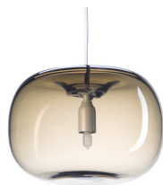
WARM GRAY, GLASS