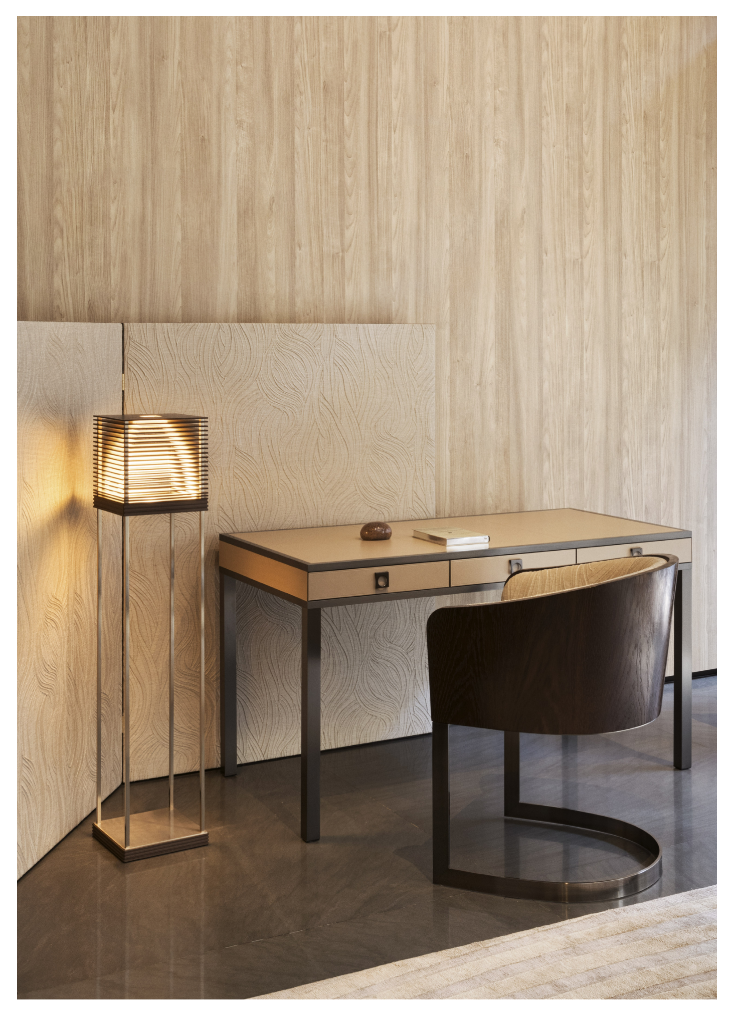
MIYA Floor lamp