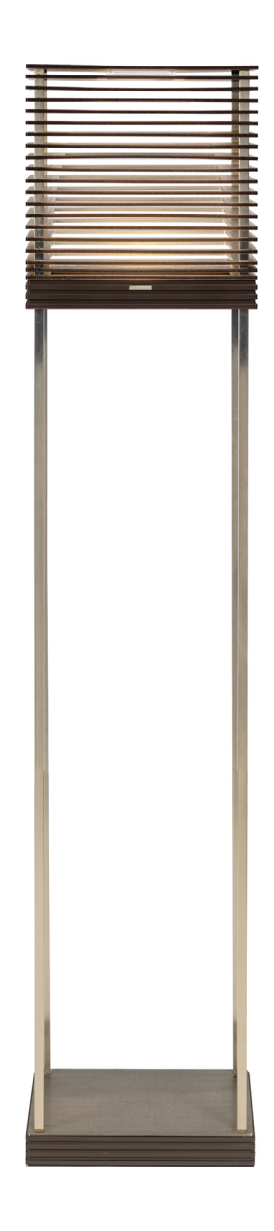
MIYA Floor lamp