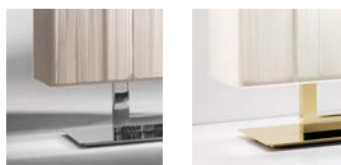
CR Chrome finish