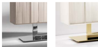
CR Chrome finish