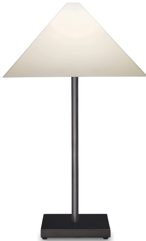
LOGO Table Lamp