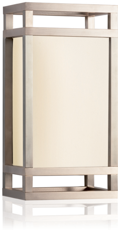
HOPE Wall Light