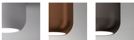
BC Wrinkled white