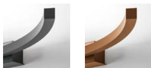
AN Anthracite grey