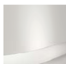
BC Pearl white

example composition code | AP | URIEL P | BR | XX | R7S