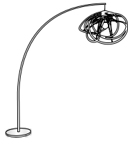
floor standard lamp white