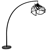
floor standard lamp black