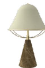
TAN300-1318 Emperador marble Satin Brass