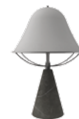
TAN300-1217 Persian Grey marble Satin Dark Chrome