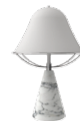
TAN300-0115 Carrara marble Chrome