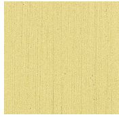
Ottone satinato Satin brass