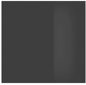
Cromo nero Black chrome