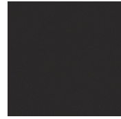
Nero bronzato Bronzed black