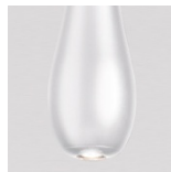
07 White RAL 9016

EELc (Energy Efficiency Label compatibility) contain built in LED lamps that cannot be changed: A, A+, A++