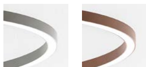
AN Anthracite grey