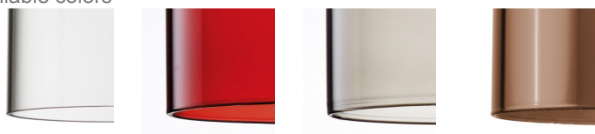
CS Crystal RS Red GR Grey BR Metallic bronze

12V - EELc (Energy Efficiency Label compatibility): C , B