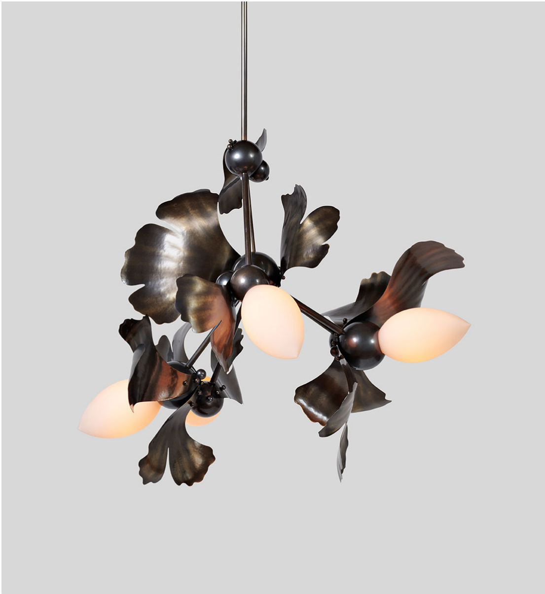
PICTURED IN OIL-RUBBED BRONZE WITH MILK GLASS