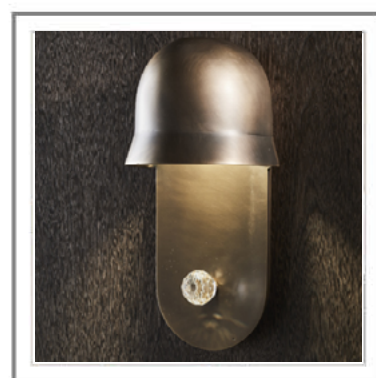
OLIVIA _ Ambientazione | Room setting.