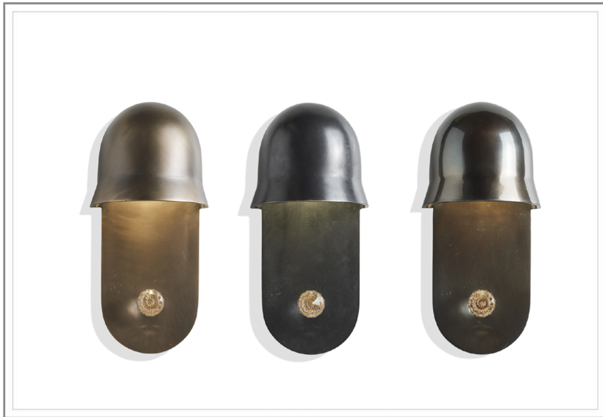
OLIVIA _ Applique con struttura in fusione di ottone finitura Bronzata (Sx), Annerita (centro) o in finitura Nero lucido Olivia (Dx), rifinite a mano. | Sconce with structure in cast brass Bronzed finish (on the left), Blackened (central) or Olivia polished black finish (on the right), refined by hand.