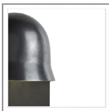
OLIVIA _ Dettaglio struttura in fusione di ottone finitura Annerita, rifinita a mano. Structure detail in cast brass, Blackened finish refined by hand.