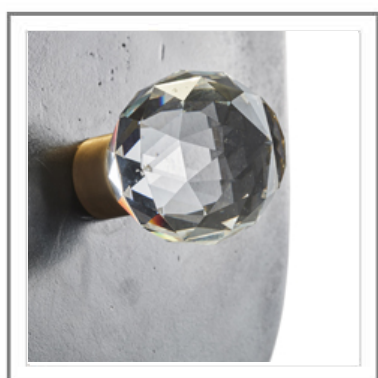
OLIVIA _ Dettaglio in cristallo. | Crystal detail.