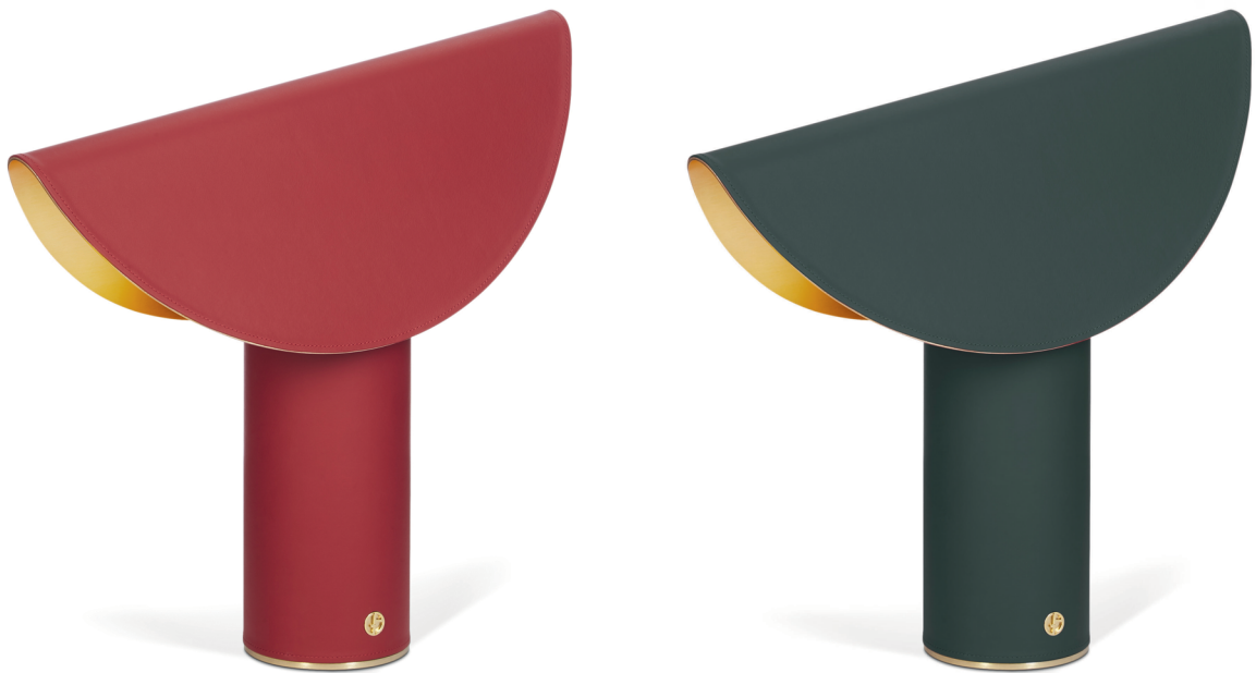
NORIKO Table Lamp