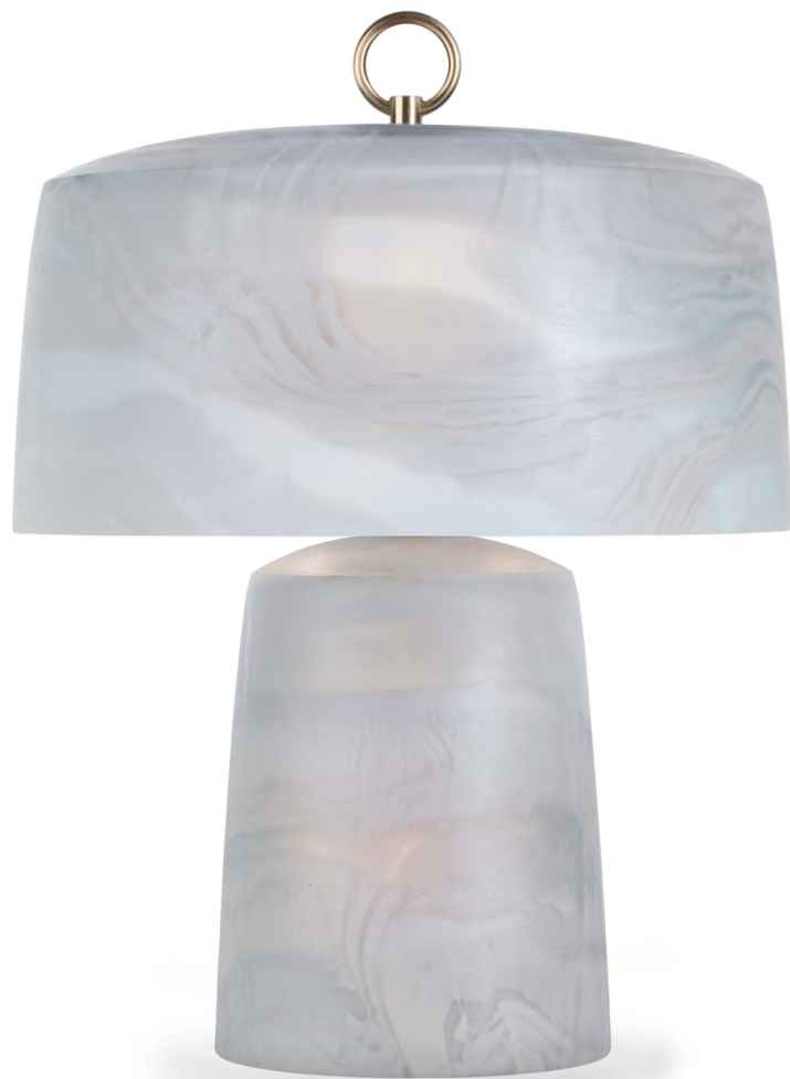
HYADES Table Lamp