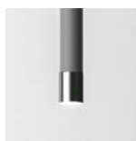
10 anthracite grey wrinkled - final black polished nickel