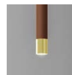
13 rust brown wrinkled final polished gold

EELc (Energy Efficiency Label compatibility) contain built in LED lamps that cannot be changed: A, A+, A++