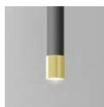
11 anthracite grey wrinkled - final polished gold