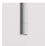
07 wrinkled white RAL 9016