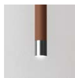
12 rust brown wrinkled final black polished nickel