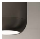
NI Matt nickel

EELc (Energy Efficiency Label compatibility) contain built in LED lamps that cannot be changed: A, A+, A++