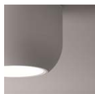
BC Wrinkled white