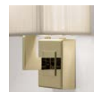
OR Gold leaf finish

EELc (Energy Efficiency Label compatibility): E, D, C, B, A, A+