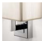
XX Chrome finish