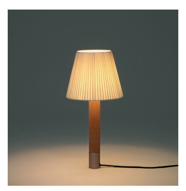
(A) Básica M1