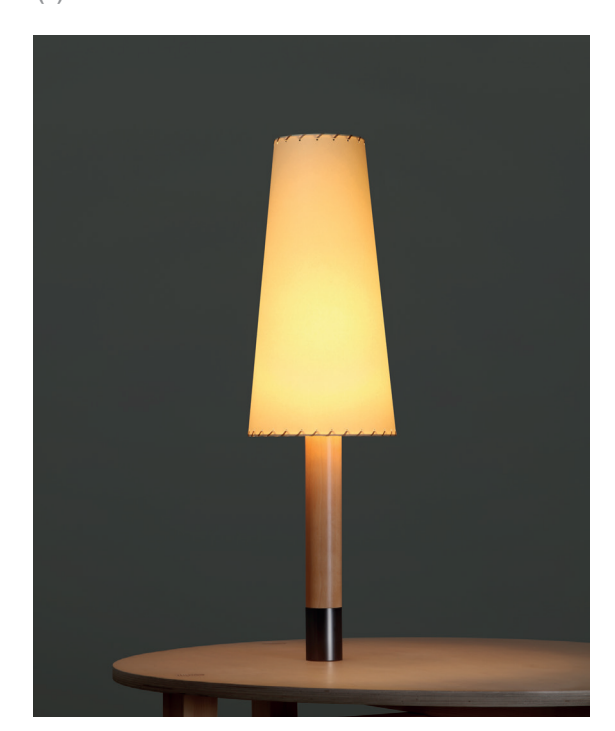
(B) Básica M2