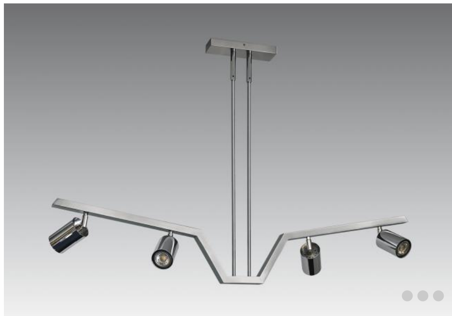
ALBATROS in brushed chrome and polished chrome

Elegant hanging lamp. A bird design. Rectangular ceiling base and adjustable spots in all directions