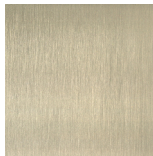
Satin Light Brass