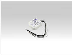
ACC241 Universal dimmer with 230Vac phase cut output.