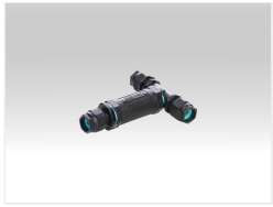
ACC221 IP68 T-connector for through wiring. 5-pole connection.