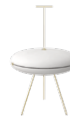
TLU400-1365 Satin Brass Satin White plastic