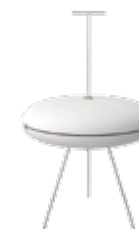
TLU400-0565 Satin Nickel Satin White plastic