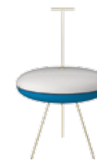
TLU400-0967 Brass Glossy White & Blue plastic