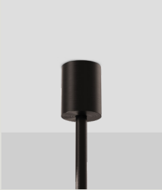
PUCK Ø14MM FIXED CANOPY CAN.PK.F14.X-XXX Ø50 X 65MM / 2" X 2.6" DRIVER HOUSED IN CEILING