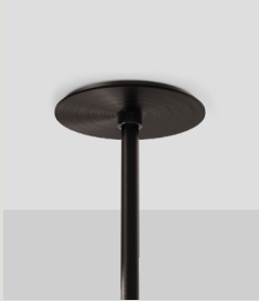
SLIM Ø14MM FIXED CANOPY CAN.SL.F14.X-XXX Ø120 X 7MM / 4.7" X 0.3" DRIVER HOUSED IN CEILING