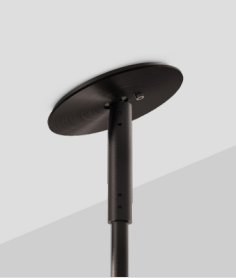
SLIM Ø14MM FIXED SWIVEL CANOPY CAN.SL.F14.SW.X-XXX Ø120 X 7MM / 4.7" X 0.3" DRIVER HOUSED IN CEILING