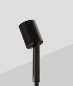
PUCK Ø14MM FIXED SWIVEL CANOPY CAN.PK.F14.SW.X-XXX Ø50 X 65MM / 2" X 2.6" DRIVER HOUSED IN CEILING