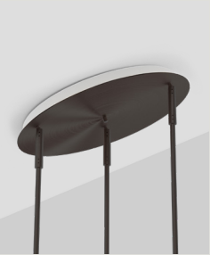
CIRCULAR FIXED SWIVEL CANOPY CAN.VC.CIR.SW.X-XXX VARIES PER ORDER DRIVER HOUSED IN CANOPY