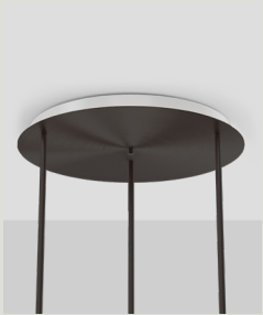
CIRCULAR FIXED CANOPY CAN.VC.CIR.X-XXX Ø480 X 37MM / 18.9" X 1.5" DRIVER HOUSED IN CANOPY

ALL ROSS GARDAM CEILING MOUNTED FIXTURES COME SUPPLIED WITH A CEILING CANOPY UNLESS OTHERWISE SPECIFIED. EACH CANOPY INCLUDES ELECTRICAL CONNECTORS, EARTH WIRE AND CABLE RETENTION TO CONNECT TO MAINS POWER. THE BELOW IMAGES DEPICT THE CEILING CANOPIES AVAILABLE WITH EACH FIXTURE TYPE. IF NO CANOPY IS SELECTED THE CIRCULAR CANOPY WILL BE SUPPLIED.