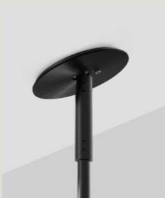
SLIM Ø14MM FIXED SWIVEL CANOPY CAN.SL.F14.SW.X-XXX