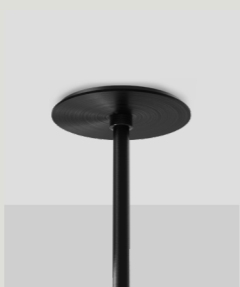
SLIM Ø14MM FIXED CANOPY CAN.SL.F14.X-XXX