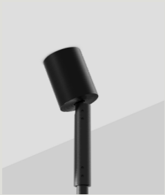
PUCK Ø14MM FIXED SWIVEL CANOPY CAN.PK.F14.SW.X-XXX