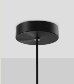
STANDARD SINGLE PENDANT CANOPY CAN.ST.120.SPX-XXX

ALL ROSS GARDAM CEILING MOUNTED FIXTURES COME SUPPLIED WITH A CEILING CANOPY UNLESS OTHERWISE SPECIFIED. EACH CANOPY INCLUDES ELECTRICAL CONNECTORS, EARTH WIRE AND CABLE RETENTION TO CONNECT TO MAINS POWER. THE BELOW IMAGES DEPICT THE CEILING CANOPIES AVAILABLE WITH EACH FIXTURE TYPE. IF NO CANOPY IS SELECTED, THE STANDARD CANOPY (NON US/CAN REGION) OR LARGE CANOPY (US/CAN) WILL BE SUPPLIED.