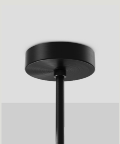
STANDARD Ø14MM FIXED CANOPY CAN.ST.120.F14.X-XXX