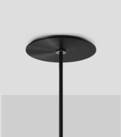
SLIM SINGLE PENDANT CANOPY CAN.SL.SPX-XXX