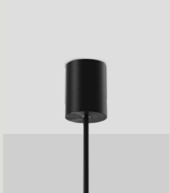
PUCK SINGLE PENDANT CANOPY CAN.PK.SPX-XXX