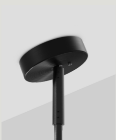
STANDARD Ø14MM FIXED SWIVEL CANOPY CAN.ST.120.F14.SW.X-XXX