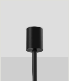
PUCK Ø14MM FIXED CANOPY CAN.PK.F14.X-XXX